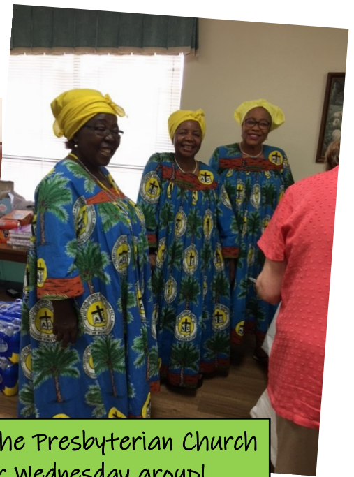
Wonderful lunch served by the Presbyterian Church in Cameroon, SA for our Wednesday group! Thank you!