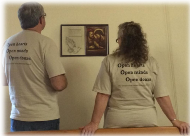
Trinity's "Day of Prayer" Retreat - October 2, 2015