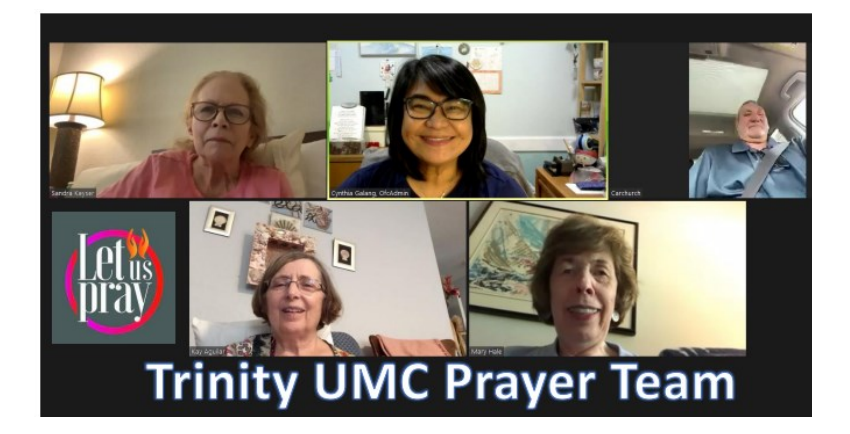
"God, help me navigate whatever challenges I encounter this day. Be my comfort and my rock. Guide me to do Your will and be an instrument of your peace today and each day. Amen."

Prayer team meets every Wednesday at 2:15pm via Zoom. Please join us or send us your prayer request at www.tumcsa.net