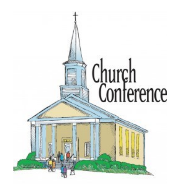
Every one is welcome to attend the church conference on Sunday, December 4th at 12:00 p.m. in the gym.