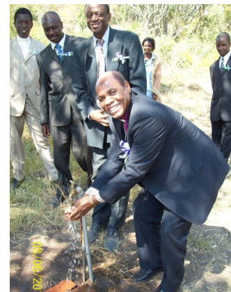
Bishop E Nhiwatiwa Resident Bishop Zimbabwe Annual Conference Drinking water

The Muziti Water System major infrastructure is complete and functional ie the borehole, water reservoir and the water distribution system. The water tank in due course need to be strengthened .There is still a need to get a decision of the Muziti Mission executive to determine what how to apply an alternative form of energy. This year there is a serious shortage of food due to drought . The government has declared Zimbabwe a “State of Disaster” and importing 230 000 tons of maizes.