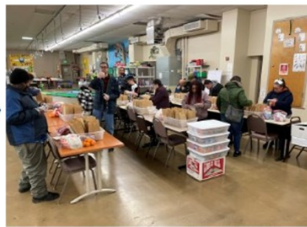
Packing by adults with IDD