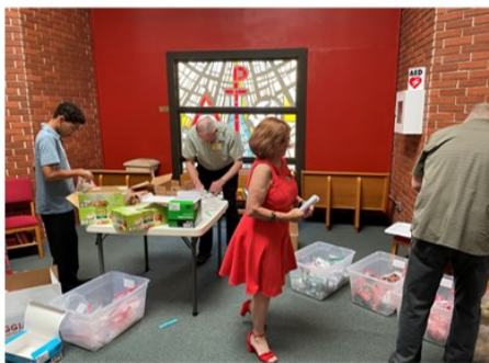
Preparation by Trinity