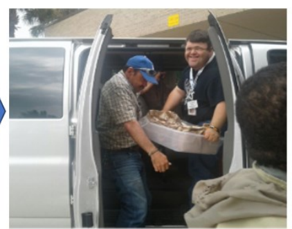
Care packages distributed free through partnering charities